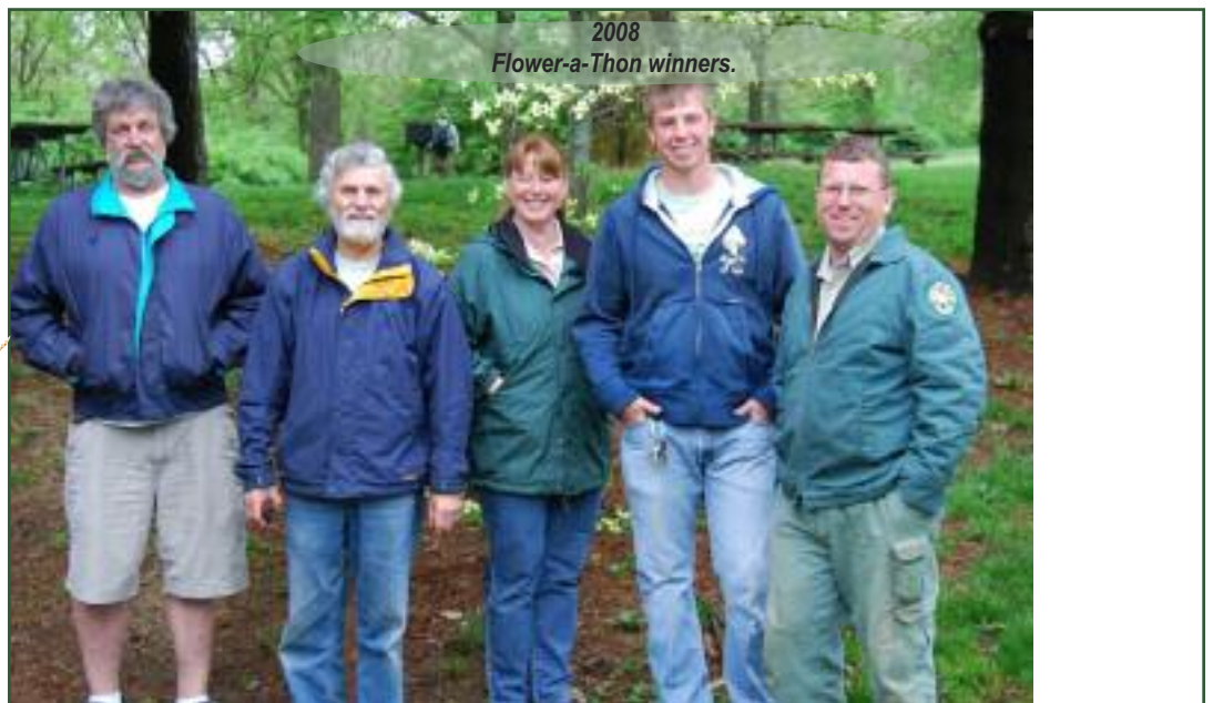
2008 Flower-a-Thon winners.