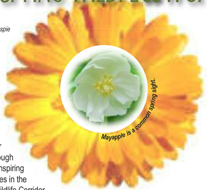
Mayapple is a common spring sight.

To register, call 513-922-2104 or log onto www.westernwildlifecorridor.org