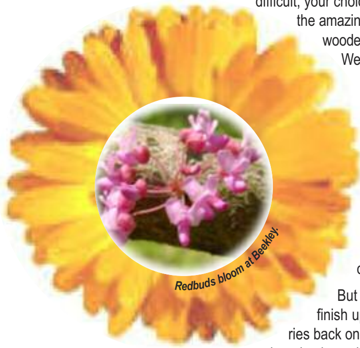
Redbuds bloom at Beekley.