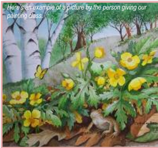
Here's an example of a picture by the person giving our painting class.

Just what were those little blooms peeking out from beneath the leaves at the edge of the path last spring; the ones that were gone once you got around to visiting again? Blooming early and disappearing almost before you know it, spring ephemerals are a class of perennials deserving more atten-