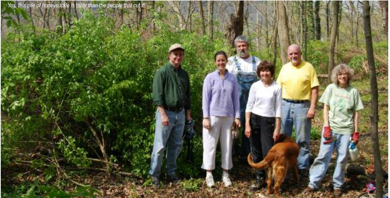
Yes, this pile of honeysuckle is taller than the people that cut it!

So, that's why WWC is obsessed with honeysuckle. That's why a new group, Connecting Community Conservation Volunteers ( www.cccv.us ), is forming to mobilize the community to control honeysuckle. The next time you see mention of a project to control honeysuckle, either with WWC or another organization, please consider giving a little time to help out. Take my word for it; whacking honeysuckle is enjoyable work with a group of like-minded people (sort of like the barn raisings of pioneer times). It is also one of the most effective ways I can think of to get whole body exercise (as good as a visit to the gym, and free too!). The best reason is that you will be helping with an extremely worthwhile cause - a way of truly making a difference. ♡