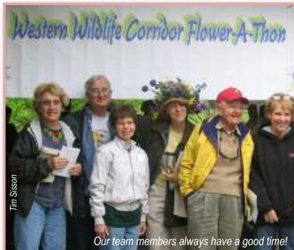
Our team members always have a good time!

The Seventh Annual Flower-a-thon will be held on Saturday, April 30th. The Flower-a-thon is an all-day event, but you can come when you want and leave when you want. We meet for a continental breakfast at Embshoff Woods in the morning. By 8:00 am, the coffee will be perked and a roaring fire will be burning. After