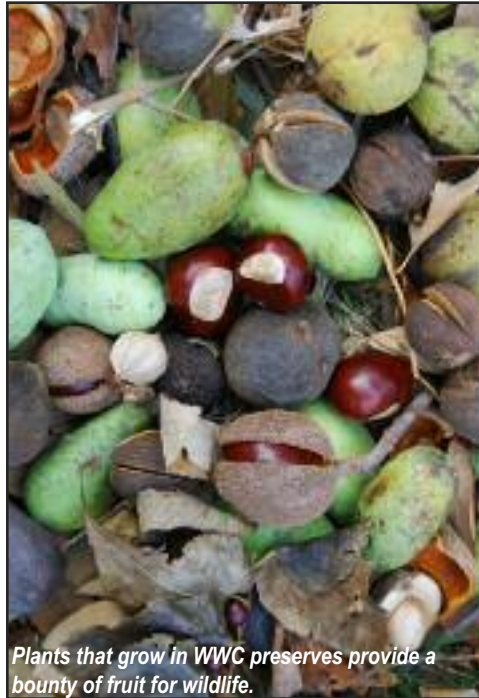
Plants that grow in WWC preserves provide a bounty of fruit for wildlife.

Show your commitment to a green Ohio by voting for Issue 2 on November 4th!