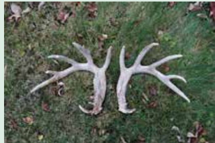
Antlers Found on Sisters Hill