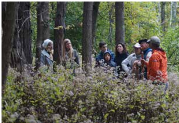
Fall Color Hike at Kirby Nature Center

Miami Township Delhi Township Oxbow, Inc. Hillside Trust Great Parks of Hamilton County Imago Village of Addyston Cincinnati Wild Flower Preservation Society