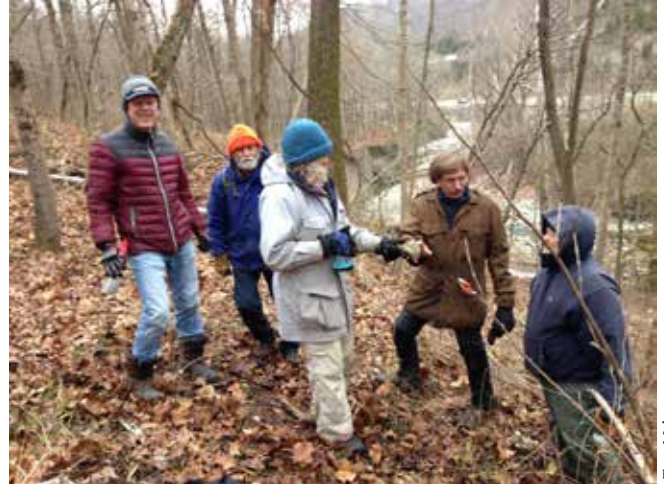
Looking at lichen at Bender Mountain

Finally, did you know that Western Wildlife Corridor volunteers do a mid-week hike almost every week? This is where we might do some light habitat restoration or trail building. Email Tim Sisson at hikertim419@gmail.com to be added to the distribution list.