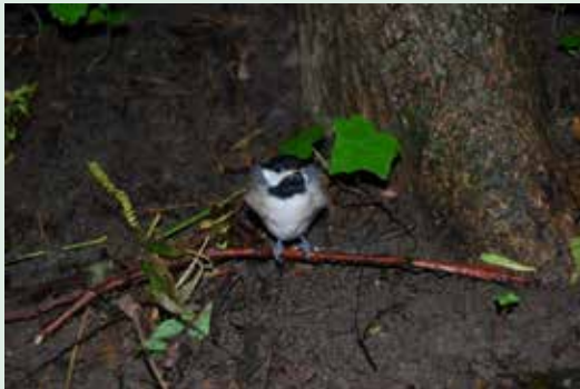
Chicadee on Bender Mountain