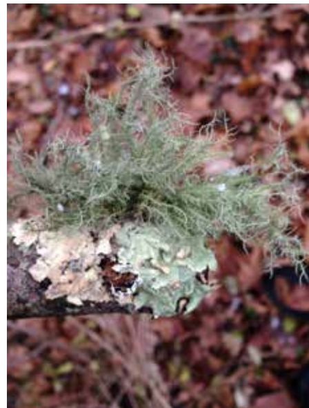
Old Man's Beard lichen at Bender Mountain