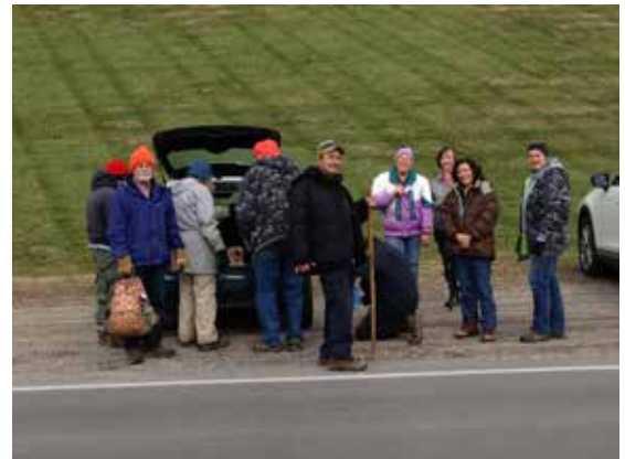
Hikers getting ready at Whitetail Woods