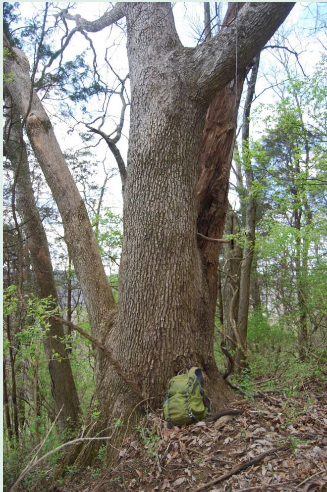
Huge Chinquapin Oak at the top of the slope at Rapid Run

Western Wildlife Corridor was founded with the goal of creating a corridor of greenspace along the Ohio River valley. As we work to achieve that goal,