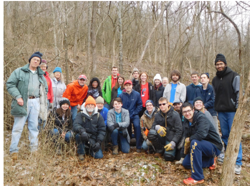
UC students honeysuckle project — Kirby Nature Preserve