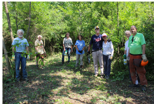
Some more of our incredible volunteers!