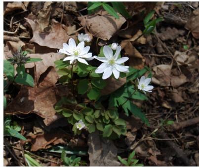
Rue Anemone —Delshire Nature Preserve