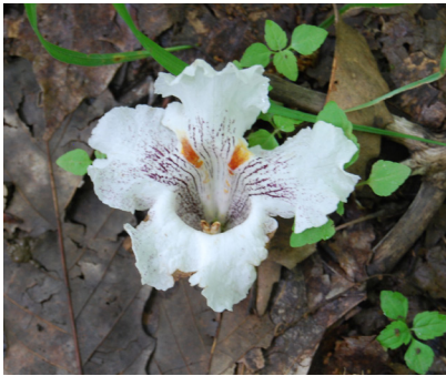
Catalpa Bloom — Kirby Nature Preserve

As Spring approaches and nature brings new life to our landscapes, most of us will be ready for a hike or two. We are offering a series of wildflower hikes on properties owned and managed by Western Wildlife Corridor, an organization with a mission to protect, restore, and preserve natural habitat, and to provide education to foster connections with nature. WWC nature preserves offer some of the best places in Hamilton County to view our spectacular native Ohio wildflowers. We could see Cut-Leaved Toothwort, Sessile and Drooping Trillium, Wild Ginger, Woodland Poppy, Blue-Eyed Mary, Greek Valerian, Dutchman's Breeches, Wild Hyacinth, Miami Mist, Fernleaf Phacelia, and many more. In addition to wildflowers, as a result of the good work WWC has done to remove invasive species, our native trees and shrubs will be leafing out among an abundance of wildlife. You will likely see a migrating warbler or two! Cost: Free. Please register for your preferred hike: Bender, April 16 , Delshire, April 22 or Kirby, April 29 .