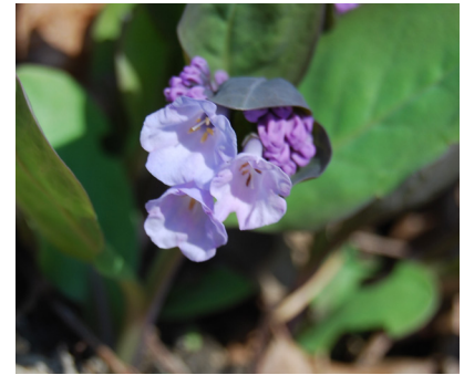
Virginia Bluebell —Bender Mountain Nature Preserve