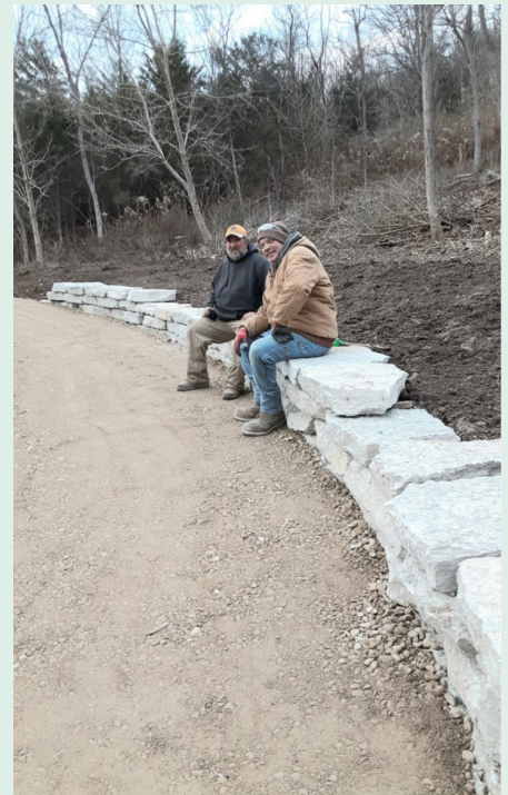
Prairie View Bench. A very special thanks to Jeffrey Allen Corporation and a great crew for going above and beyond in constructing our trail.