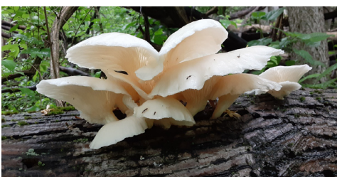
Fungus — Bender Mountain Nature Preserve