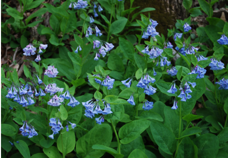
Bluebells — Delshire Nature Preserve