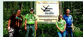
Thanks to Our Great Volunteers Too!