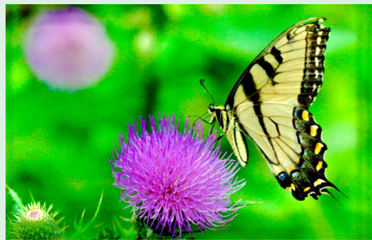
Butterfly on Thistle — Kirby Nature Preserve Prairie