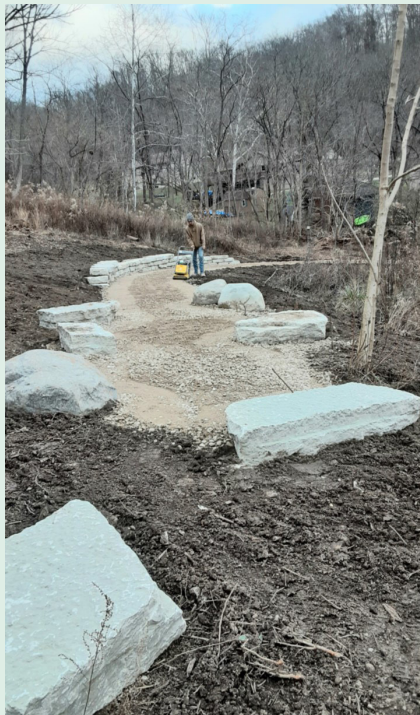
Prairie Trail rock features provide visual delight.