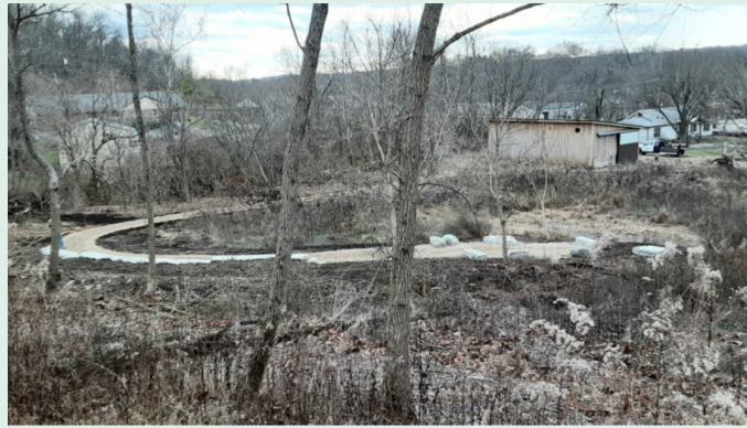
Overview Of Prairie Trail And Barn.